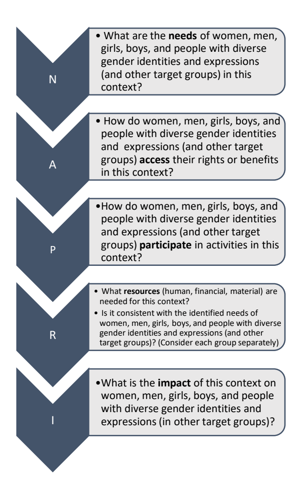
Fig. 3. List of possible questions by applying the NAPRI gender analysis tool to a cybersecurity context

analyze the context, project ideas, policies, laws, or other actions/interventions that use nothing more than research or reflection. It can also serve as a framework for extensive participatory gender analysis using various data collection methods (DCAF; OSCE/ODIHR; UN Women, 2019). The NAPRI tool can be adapted to any context and is based on the principles of good governance in the security sector. This provides a good starting point for identifying how and to what extent gender has been considered in the context of a good SSG. Applying the NAPRI gender analysis tool to a cybersecurity context reveals the following list of possible questions: