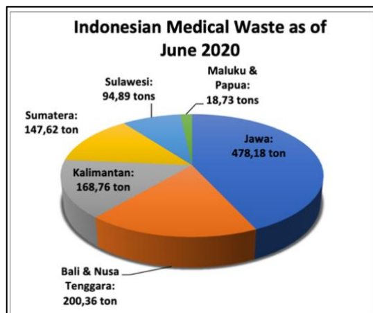
Fig. 2. Amount of Medical Waste during the Covid-19 Pandemic in Indonesia