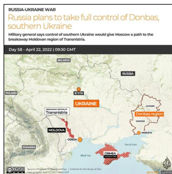
Fig. 1. Donbas Region, Area Targeted by Russia

To sharpen this discussion, the reasons why football institutions in Europe are involved in the Russia-Ukraine conflict are interesting to analyze. The authors argue that the existence of distribution problems triggers this involvement.