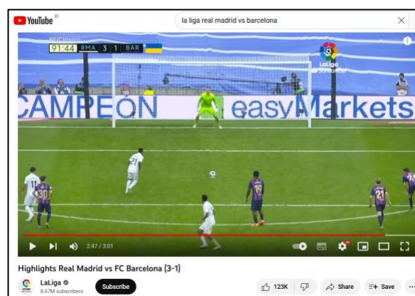
Fig. 2. Views of La Liga Matches after the Outbreak of the Ukraine-Russia Conflict.

transfer of the Ukrainian-Russian political security conflict to football has an effect on European Solidarity, which can be indicated by how European football institutions display symbols of solidarity in football matches.